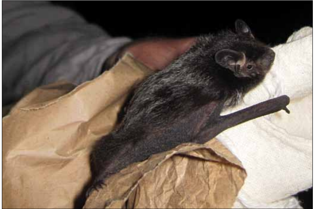
One of the test subjects, before being equipped with a transmitter.

In order to make wise forest-management decisions, we need to know the habits and needs of wildlife, so we designed a study to capture roosting and foraging habitat information for the silver-haired bat in Elko County, Nevada.