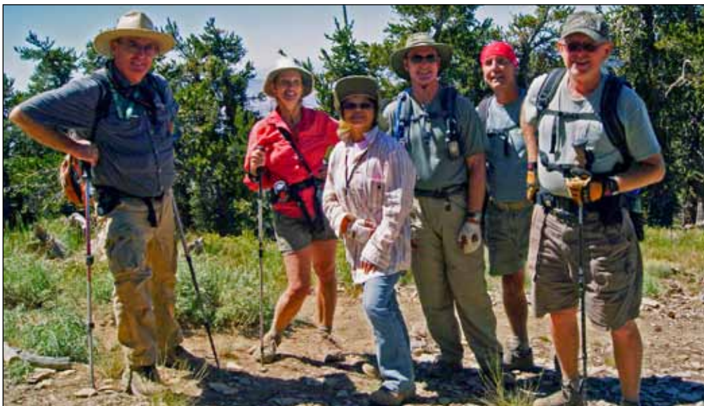
Mt. Charleston is better off now, thanks to these dedicated volunteers.

Camping above 10,000 feet for two weeks in August, Friends and volunteers re-routed the user-created route to the summit, easing the grade, avoiding sensitive habitat and making it more resistant to erosion. The new trail benefits hikers, endemic plants, animals and especially the rare Mt. Charleston Blue butterfly.