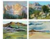
Greeting Cards Blank. Set of 8