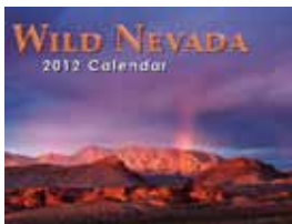
Wild Nevada Calendar

Various colors and sizes. Call for availability.