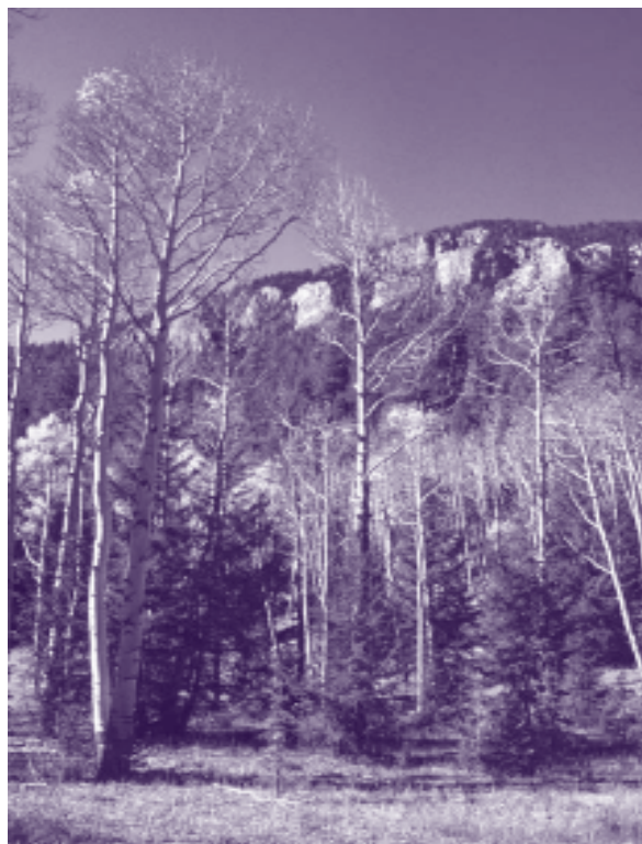
The Highland Ridge citizen-proposed wilderness area is one of the crown jewels of the Nevada Wilderness' White Pine County Wilderness Proposal.

Wilderness has been an important part of my life for 70 years. From my first forays into the still-wild hills of Southern California, to trips with my mountain-climbing friends in the Southern Sierra, to snowshoe adventures in the backcountry of Yosemite and Sequoia National Parks, to exploring the Gila Wilderness of Southern New Mexico, and finally to becoming acquainted with the magnificent wild lands of Nevada, I have always been happiest when I could feel at one with the natural world. Although I am no longer able to go more than a few hundred yards into