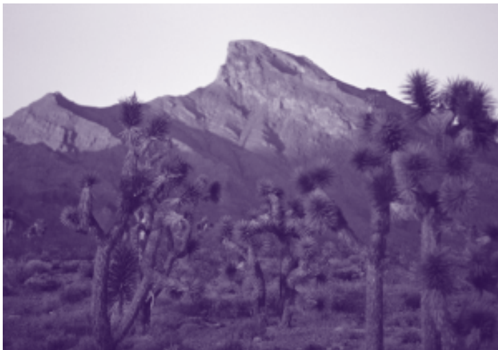
Moapa Peak in the Mormon Mountains.

This complex of soaring limestone peaks and deep rugged valleys is wonderful habitat for bighorn sheep, desert tortoise, the endangered Las Vegas bearpaw poppy and numerous other species. It's also a great landscape for exploring less than two hours from the Las Vegas Valley. The Mormon Mountains Wilderness is the second-largest wilderness in Nevada (at 315,700 acres, the Black Rock Desert Wilderness is the largest).