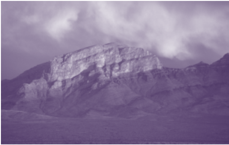
Sunset over the Meadow Valley Mountains.

ing rocks, natural arches, odd volcanic hoodoos and the largest stand of ponderosa pine trees in eastern Nevada. Hiking, camping, backpacking, hunting and horseback riding are good in this area of forest and eroded volcanic cliffs.