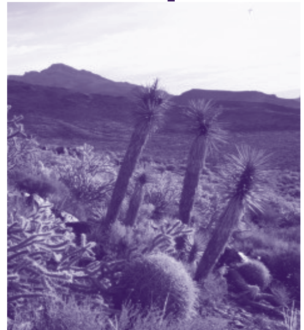
Moapa Peak, Mormon Mountains with Mojave vegetation in foreground.