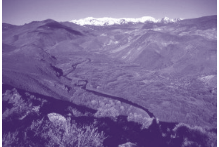
Several miles of the East Walker River flow wild and free through the Bald Mountain Proposed Wilderness.

From Reno/Carson, drive south on U.S. 395 toward Topaz Lake and Bridgeport. At Holbrook Junction (a few miles north of Topaz), turn left/east onto highway 208, and follow it over Jack Wright Summit to Wellington. From Wellington, continue south-east on highway 338 for about 16 miles. Turn left/east onto the unpaved Nye Canyon Road (Forest Rd 031) and follow it for about 7 miles (ignoring side roads that fork off) east, then south up above treeline, where Forest roads 141 and 141A will fork. Follow the left/easterly fork (141) for about 1 mile to a good parking spot before the road gets too rough. From the car, follow 141 south about 3 miles to the summit.