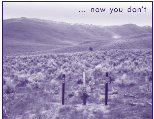
Work trip in the South Jackson Wilderness decommissions a vehicle trespass route.