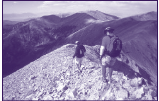
Photos: (top) Hikers trek the spine of the range. (middle) Hikers gather at the summit. (bottom) A forested ecosystem thrives on high.

This spectacular area is at the heart of the Nevada Wilderness Coalition's Wilderness Proposal for eastern Nevada. The approach to this area, in the Duck Creek Basin, has been hammered by off road vehicles in the last decade. Though the citizen-proposed area was administratively protected under the Clinton Administration Roadless Rule, the Bush Administration's relentless assault on roadless areas continues. The only way to see this area's wildland and wildlife values permanently protected is to designate the area as Wilderness. With the eastern Nevada public lands process underway, now is the time to visit, write letters, and call elected officials to tell them this area needs the protection afforded by Wilderness designation.